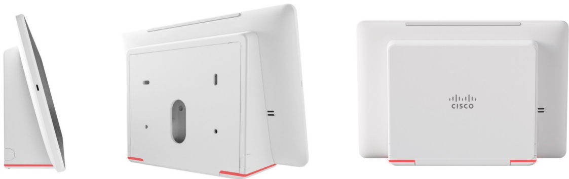
Figure 5: Rear and side views of the wall-mount Room Navigator