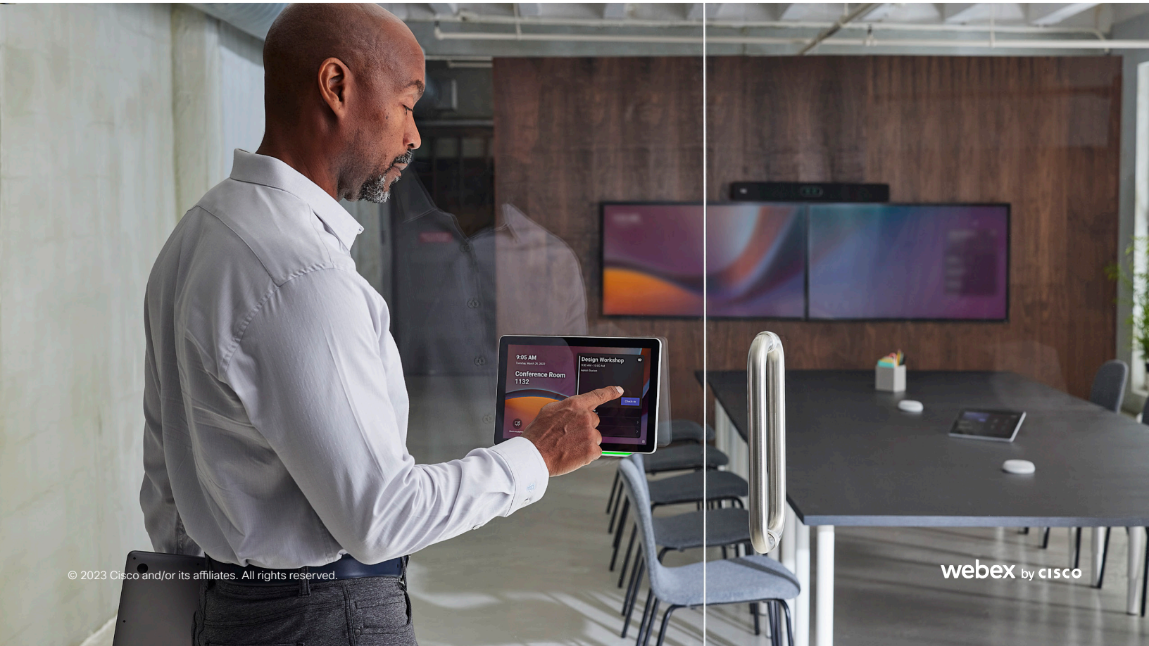
Figure 4: Room Navigator powering the Microsoft Teams Panel experience (coming in Q3 2023)