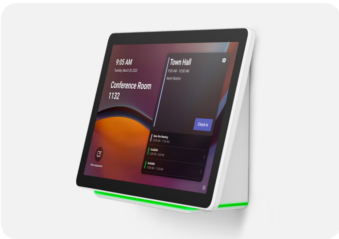
Figure 3: Room Navigator deployed as a native Microsoft Teams Panel

And when using the native Cisco solution for room booking, you can significantly simplify your deployment, lower total cost of ownership and ease management efforts by leveraging a single vendor to provide platform agnostic video collaboration devices, the underlying meeting service, the room control hardware, and the associated room booking software solution.