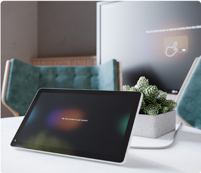
Above: Webex Room Navigator unit used as a standing monitor controller

With the Webex approach to room controls and space reservation, you can significantly simplify your deployment, lower total cost of ownership and ease management efforts by leveraging a single vendor to provide platform agnostic video collaboration devices, the underlying meeting service, the room control hardware, and the associated room booking software solution.