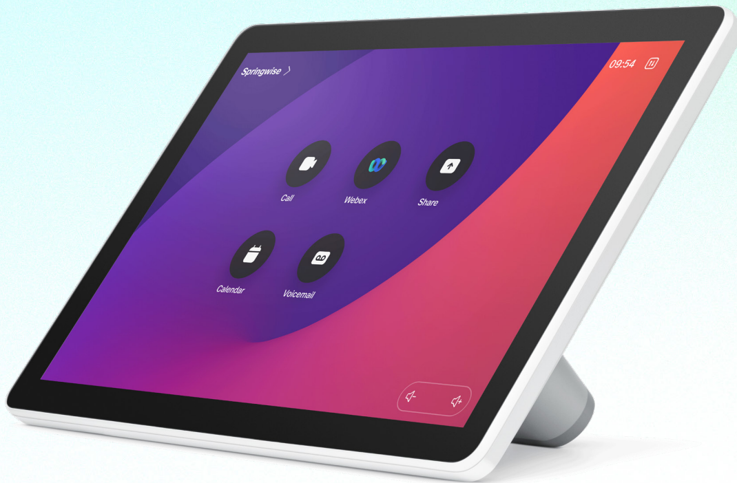
Table-stand touch panel