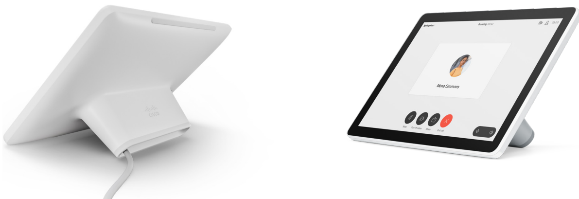
Above: Room Navigator table-stand touch panel from a back and front perspective view