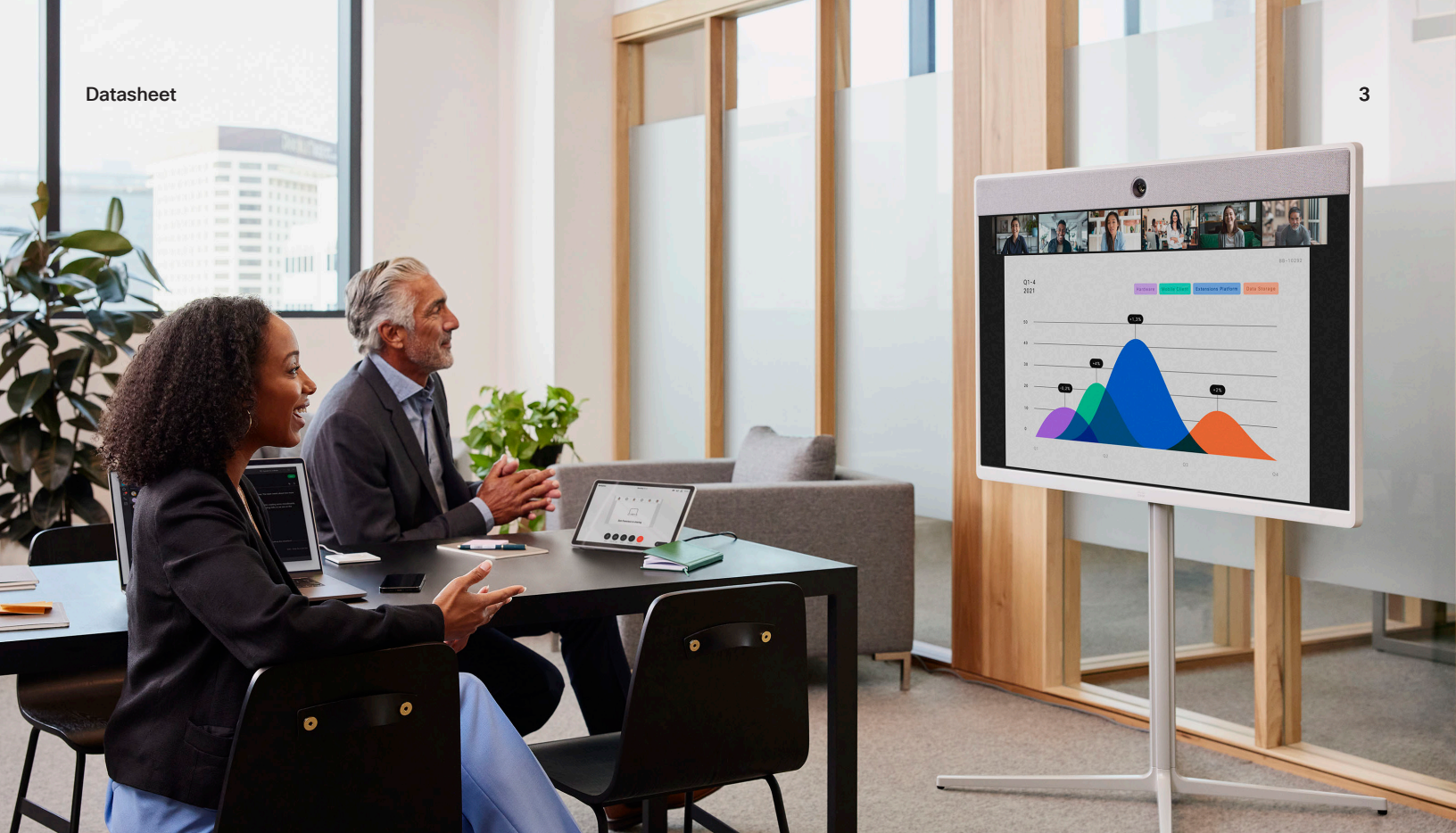
Above: Webex Room Navigator unit used as table-stand room controller