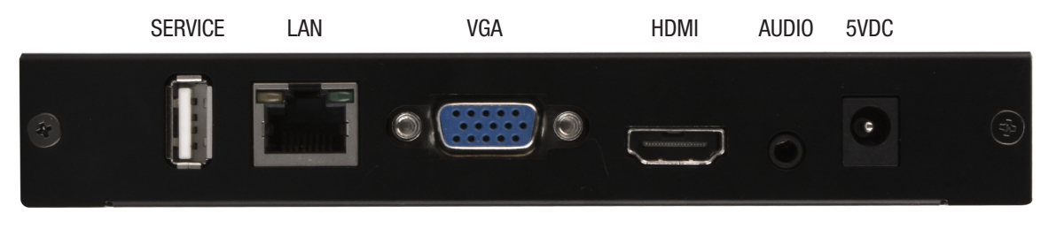
AM-100 – Rear View