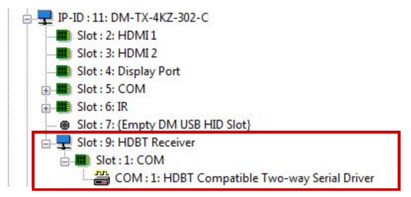
Addition of HDBaseT Receiver to Slot 9 and COM Port in Slot 1

When the third-party HDBaseT receiver device is added to slot 9, the HDBaseT Receiver symbol adds a COM port to the device and enables two-way serial communication.