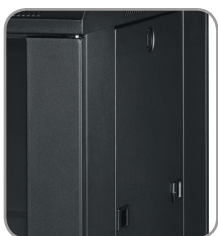
Removeable side panel