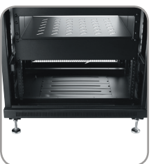
Top and bottom ventilation