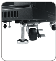
Adjustable feet that level and stabilize